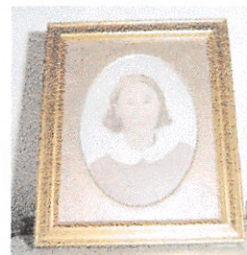
1987.695 Image 1