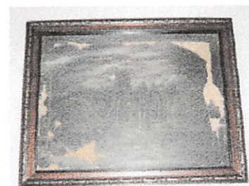
1996.778 Image 1

Home loc First Floor, Entryway Description Landscape Painting by Catherine Ladd - 11-7/8" x 15-3/4" - Dark landscape showing gothic castle in moonlit forest, two men on horseback in foreground - print with gouache painted over