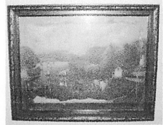
1996.777 Image 1